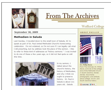
The Wofford College Archives blog.