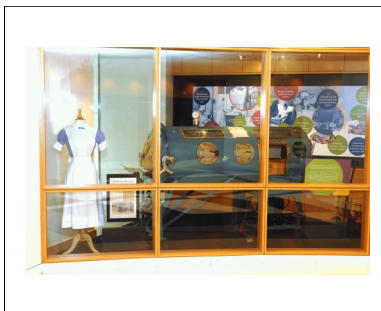
The History Center at the Greenville Hospital System University Medical Center.