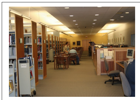
The South Carolina Room at the Hughes Main Library, Greenville Public Library System