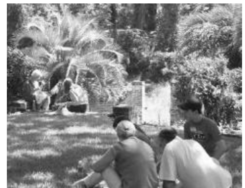
The Summer Social group enjoyed a picnic lunch along the banks of the Cooper River.

The SCAA group also watched a documentary on the Trappist lifestyle and operations at Mepkin, and viewed the monks' noon worship service. The SCAA summer social event encourages the exchange of knowledge among cultural institutions in the state and serves as a benefit fund-raiser for the SCAA scholarship program.